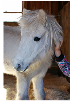
Violet the Miracle Pony